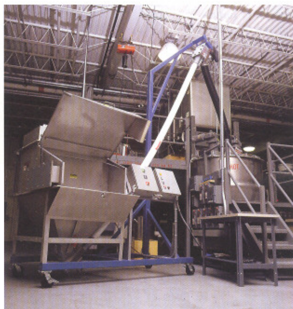
ABOVE: Bag dump station, dust collector and flexible screw conveyor are self-contained on a castor-mounted frame which is wheeled between process vessels requiring 135 kg batches of fumed silica.

In addition to improving worker safety and plant cleanliness, the mobile bag dump and conveyor system "frees workers for other process-related functions," McGown says.